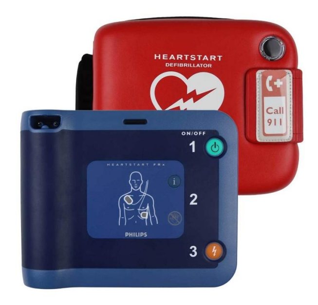
Figure 2: Philips HeartStart HS1/Onsite AED Reference